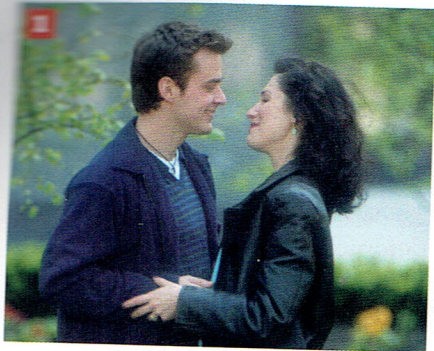
They love themselves / each other .

1 Describe the film scenes. What do you think is going to happen next?