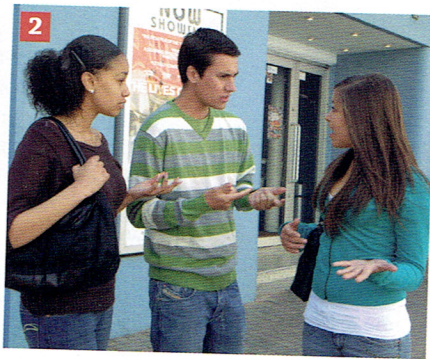
They are talking to each other / themselves .