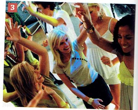
Each / Every person is dancing.

2 Choose the correct words in the captions from exercise 1. Then check with the rules below.